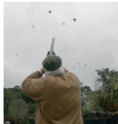
High and challenging birds