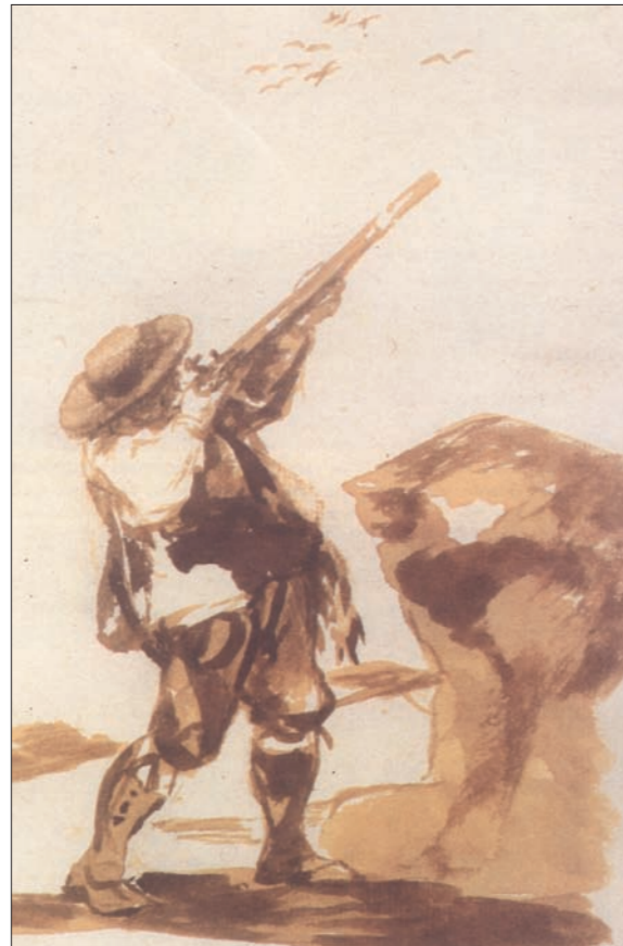
Hunter shooting birds - Goya - Rotterdam, Boymans van Beuningen Museum