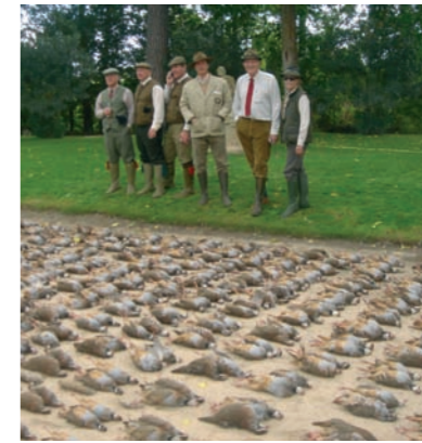
The game parade

Depending on the areas, the shooting season for red-legged partridges starts the beginning of October and ends the middle of February. We suggest October November or December. Some Estates provide longer seasons into mid March.