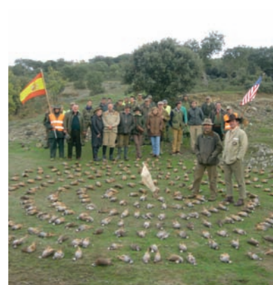
Shoots for full lines and single shooters