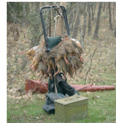
Perfect shooting organization