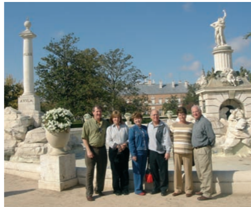
Shooting and sightseeing in Spain