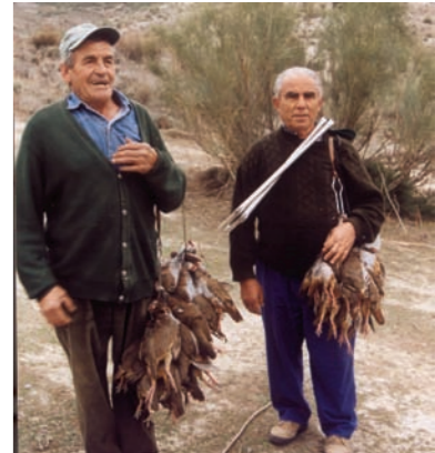
Your loader and your spotter