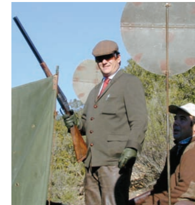
Taking care of safety shooting