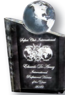
Outstanding International Professional Hunter of the Year 2010